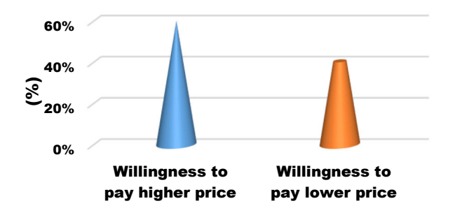
Figure 2: Distribution of consumers' willingness to pay a premium for Akikon tomato variety.